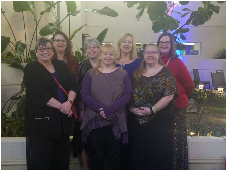
District 11 Represents at Winter State Convention

Rheumatoid Arthritis affects joints and is usually assymetrical meaning that if the left knee is hurting, then the left hand is hurting also. More facts about this disease coming soon. In the meantime, please continue to share your loose change to make a difference to someone with Rheumatoid Arthritis!